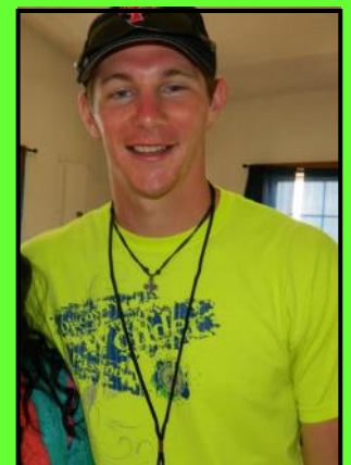
Price Ferrell Student Ministry