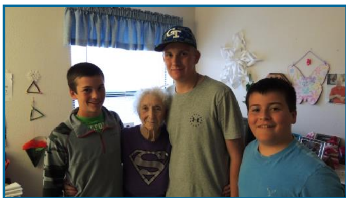
The Student Ministry recently visited residents at the Texoma Healthcare Center in Sherman.